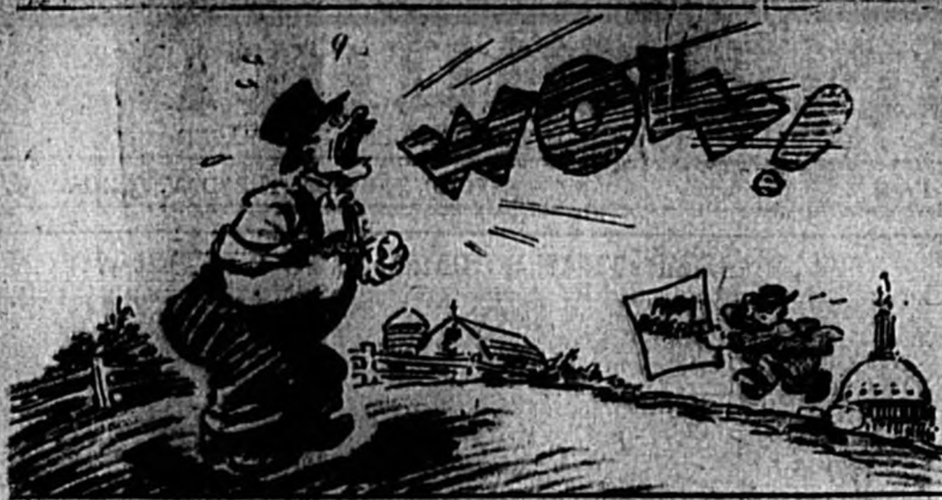
WHEN FARM PRICES ARE LOW