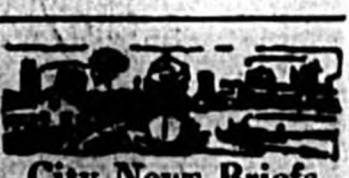
City News Briefs