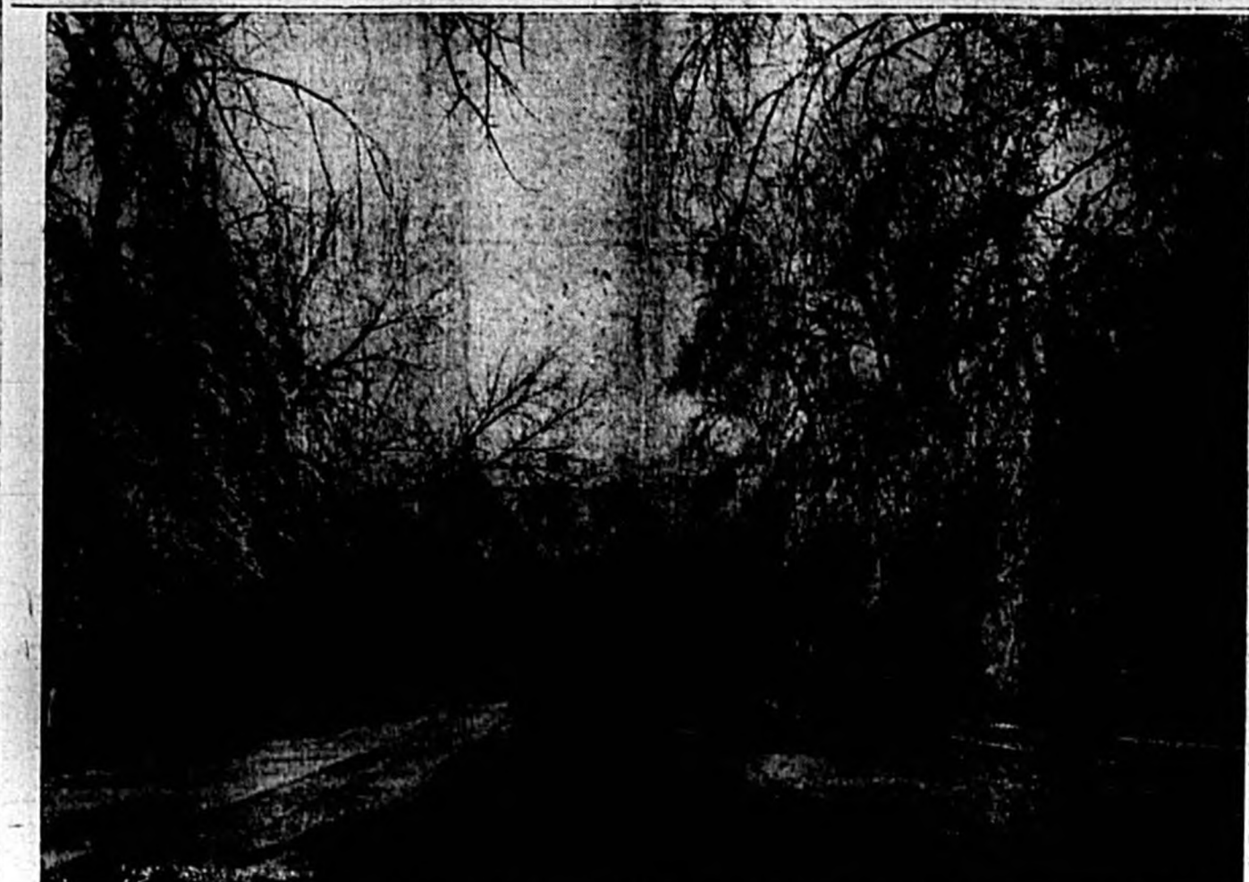
When freezing rain and sleet hit the deep South, nature made beautiful pictures for people who have seen but little of winter's patterns. Above picture was made on one of Atlanta's streets.