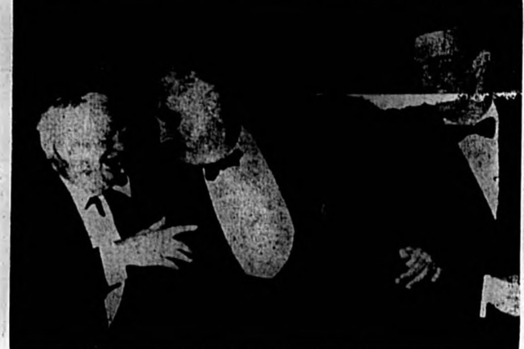
Vice President Garner draws a grin from President Roosevelt as the two met at Jackson Day dinner in Washington. Franklin D. Jr., right, escorted his father to the dinner and seems to be enjoying the joke too.