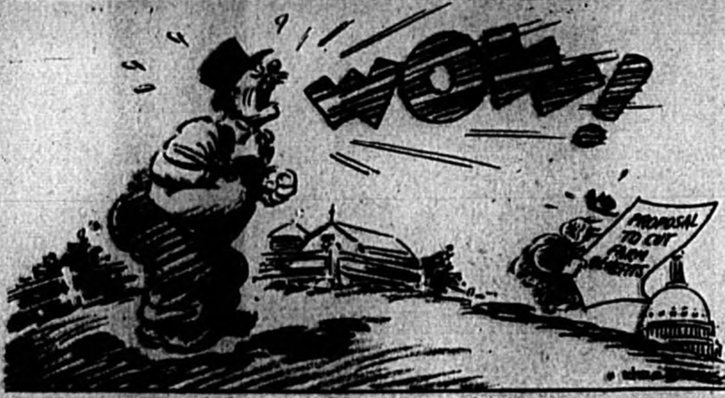
WHEN FARM PRICES ARE HIGH