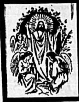
16 1/2 INCHES 137-H

Serene Beauty Fempt your embroidery skill with either or both of these lovely panels! Nos. 120-H and 137-H each contain hot-iron transfer, color chart, stitch illustrations. Two separate patterns.