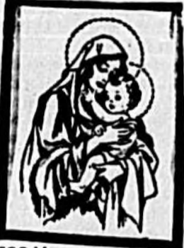
120-H 14 1/2 INCHES