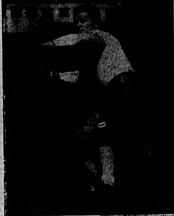
...SEE A NEW STAR in the Carl Hubbell (above), 20-year-old sophomore pitcher, who pitched a perfect game for the first time in his career. Hubbell is a poor freshman pitcher at the University of California, Berkeley.