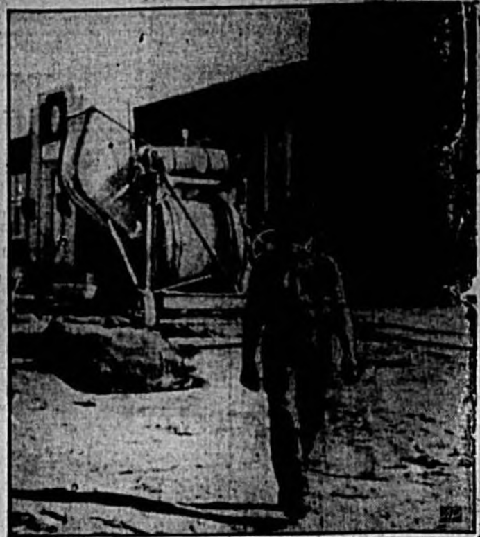
BUT GETS IN DUTCH sometimes as in East Lampeter township Pa., where Amish "plain people" have boycotted a $125,000 WPA-financed high school, announced they would carry the fight to the Supreme Court. This one has just inspected the building.