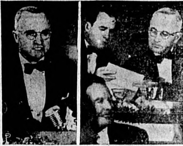
ADDRESSING 1,000 MEMBERS attending the national Young Democrat dinner in Washington, President Truman (left) is shown as he stated: "During the next four years there will be a Democrat in the White House—and you're looking at him." At the right, the Chief Executive is shown in a telegram by Sen. J. Howard McGrath (D-R.I.) congratulating him on recognizing the new Jewish state of Israel.