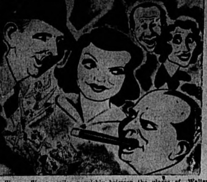
Simone Simon smiles roguishly between the glares of Walter Winchell (upper left) and Ben Bernie (with the big cheroot). The trio is starred in Darryl F. Zanuck's great new idea musical show, "Love and Hises."