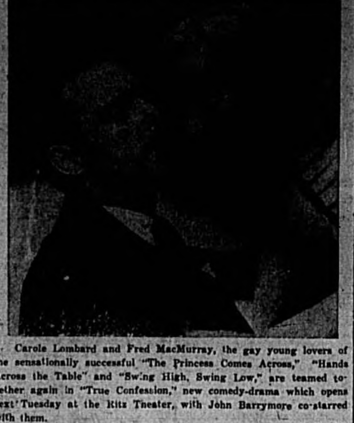
Carol Lombard and Fred MacMurray, the gay young lovers of the sensationally successful "The Princess Comes Across," "Hands Across the Table" and "Swing High, Swing Low," are teamed together again in "True Confession," new comedy-drama which opens Tuesday at the Rita Theater, with John Barrymore co-starring with them.