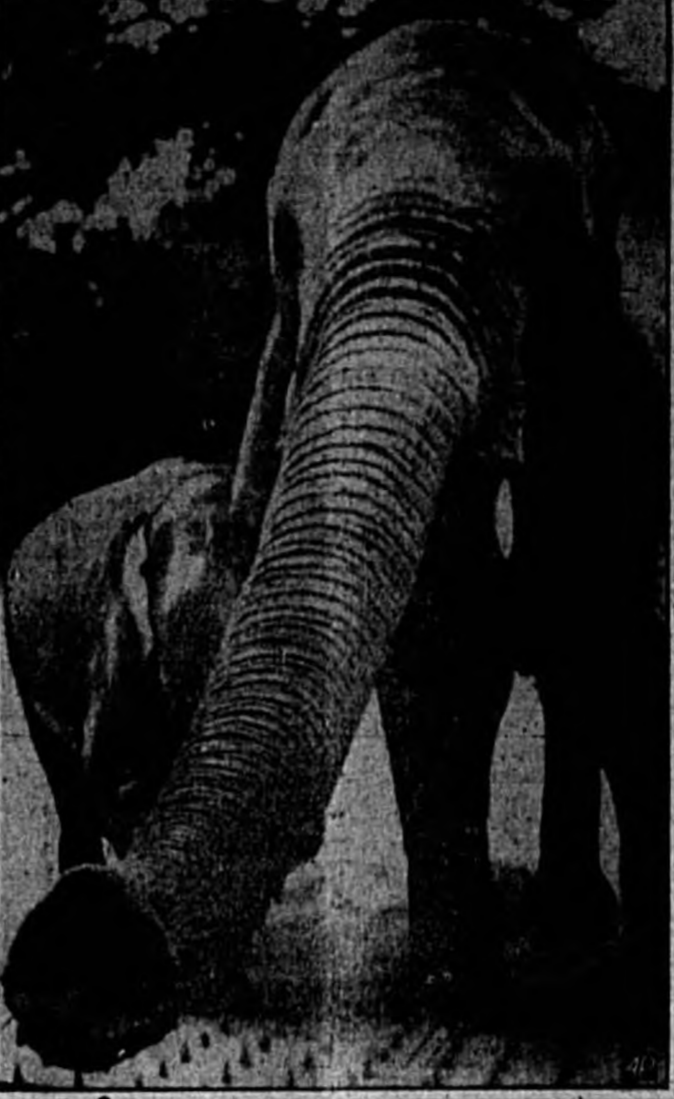
Wearing out this elephant in Berlin's zoo all day would soon pack out this elephant in Berlin's zoo...