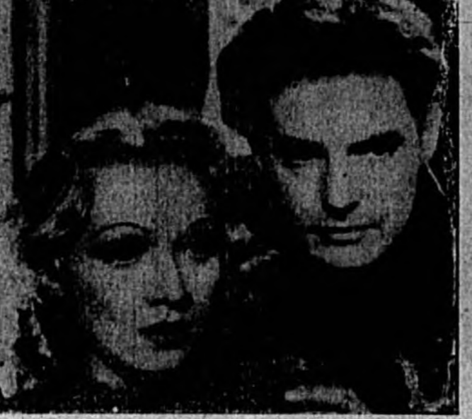
Marlene Dietrich and Robert Donat as the lady in distress and the modern-day knight who comes to her rescue in "Knight Without Armor," the Alexander Korda production of the famous James Hilton love story which comes to the Rita Theatre Friday.