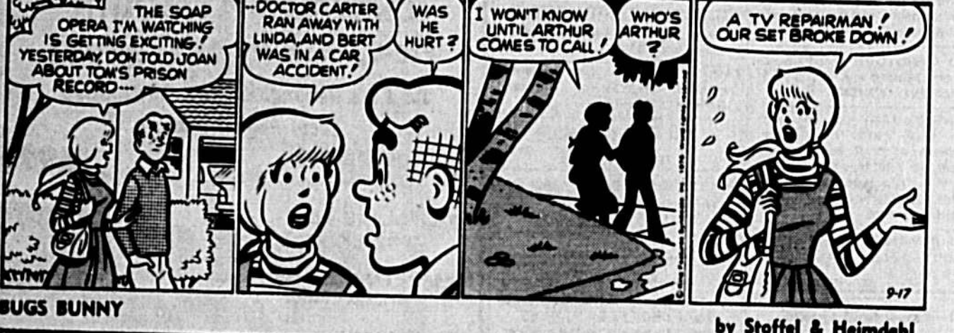
Archie by Bob Montana