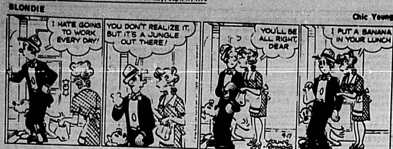
Blondie by Chic Young