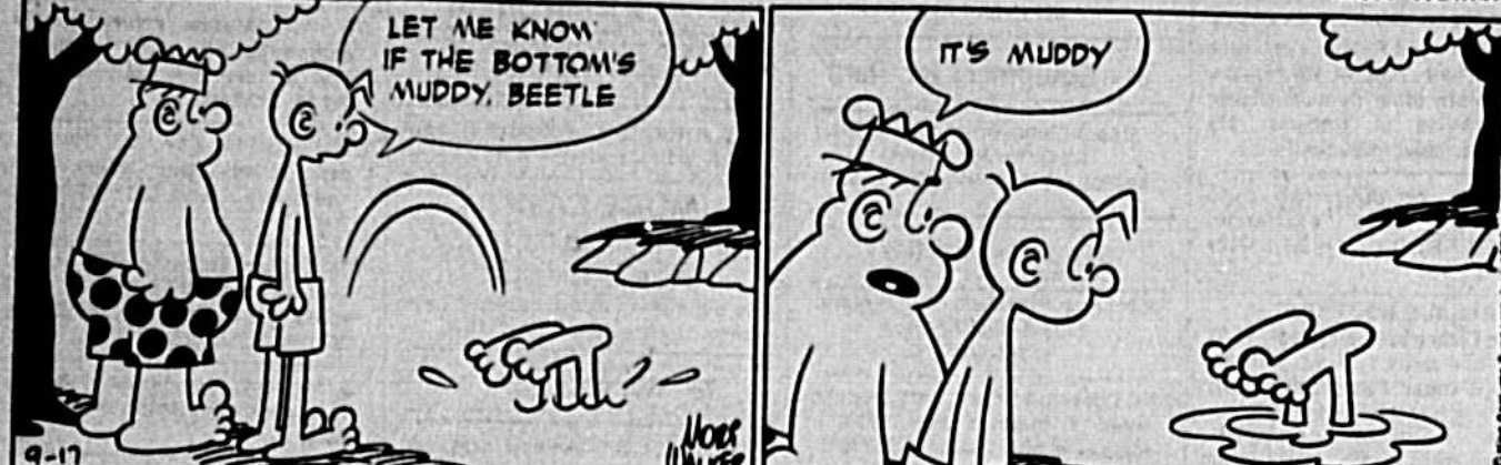
Beetle Bailey by Mort Walker