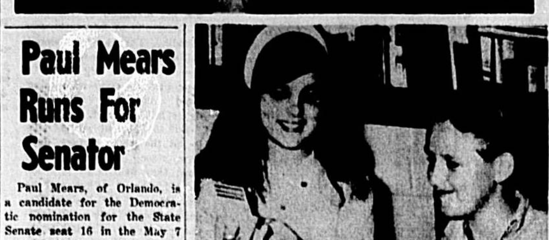
Students in a classroom discussing politics.

In the last week of South Seminole Junior High School in Casselberry there is an unmarked door behind which politics are being discussed in a crowded narrow smoke filled room and active responsible citizens are being appointed.