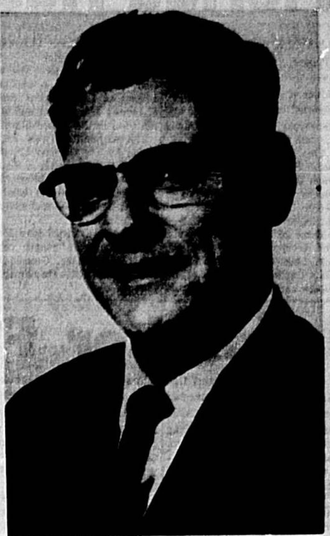
JUDGE KARLYLE HOUSHOLDER