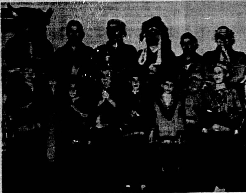
The rocket gun developed during World War II was given the name of launch by American soldiers who thought it looked like the musical instrument known by that name.

LEWIS, Kessell, Howell (AP) — Drivers who like to "dig out" from a stop sign a penalty on the island of Kauai.