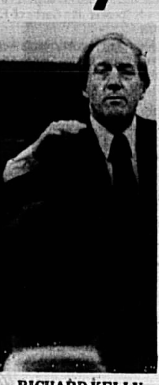
RICHARD KELLY ... HAS SUPPORT

ORLANDO, Fla. (UPI) — Hopes by Democrats that "Abscam" is a political weight that could drag Richard Kelly to ignominy are diminishing, but the road back to Washington could be longer this time for the third-term Republican House member.