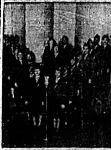
WINGS OVER JORDAN "OVERSEAS" CHOIR