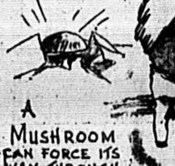
A MUSHROOM CAN FORCE ITS WAY THROUGH ASPHALT STREET PAVING