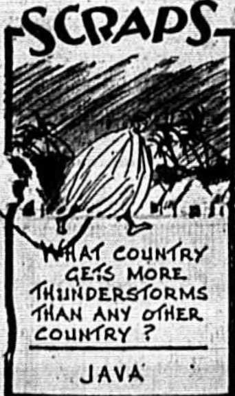
WHAT COUNTRY GETS MORE THUNDERSTORMS THAN ANY OTHER COUNTRY? JAVA