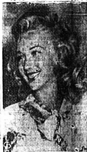
FILM AND STAGE actress Carole Landis is all smiles after being granted a divorce in Las Vegas, Nev., from Maj. Thomas C. Wallace of the U.S. Army Air Forces. They were wed in London, England, in 1943.

PORTRAITS PAINTED IN OILS For information call Essex Studio Phone 176