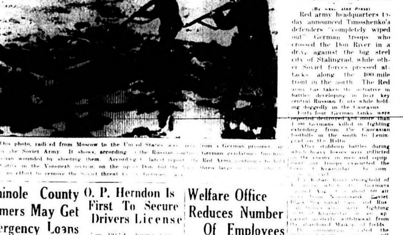
Soviets Press Attacks To North And Hold In Caucasus