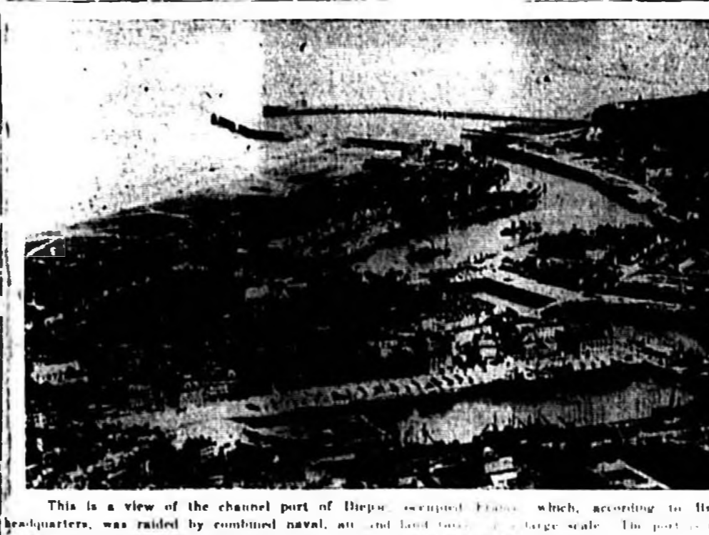
This is a view of the channel port of Dieppe, occupied France, which, according to British headquarters, was raided by combined naval and air land forces.

The raid was a combined naval and air land force. It was a surprise attack on the Dieppe harbor, which was held by German forces.