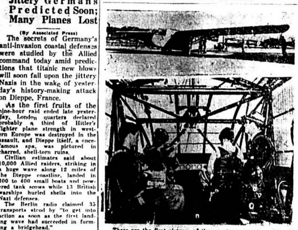
Glider Carries 15 Men