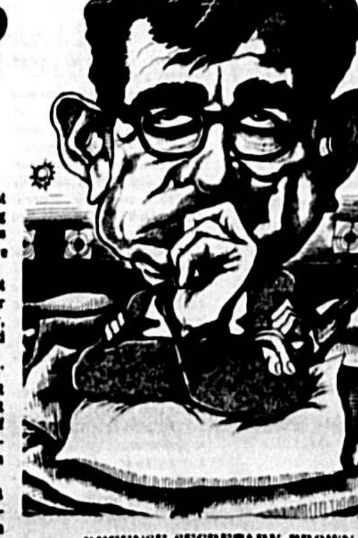
DEFENSE SECRETARY BROWN